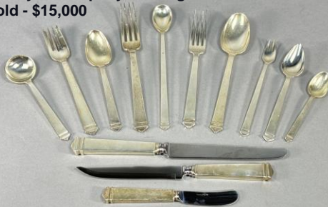
Tiffany & Company Sterling Silver Flatware Service Sold - $15,000