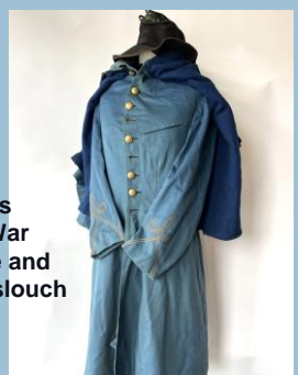
Captain Charles Storrow Civil War navy blue cape and overcoat with slouch hat Sold - $8,700