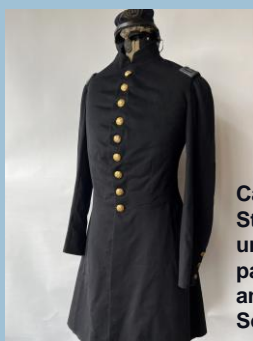
Captain Charles Storrow Civil War uniform with pants, long jacket and two kepi Sold - $9,000